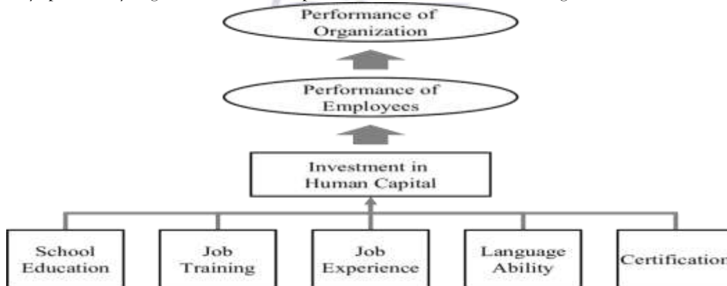
Fig 1: Human Capital Theory of Becker 1992

According to the human capital hypothesis, training and education are investments that raise a person's earning potential and productivity, which promotes economic progress and the welfare of society. It emphasizes how important education is to creating a competent labour force and encouraging creativity, making it a vital component of both personal and societal advancement (Becker, 1992). Over the course of their careers, those with greater education and skill levels typically make more money. Education increases one's employability and opens up more favourable employment prospects. People from underprivileged backgrounds can raise their socioeconomic standing with education. Education promotes communication, problem-solving, and critical thinking abilities, all of which support general personal development. Social cohesion, civic participation, and informed citizenship are all enhanced by education. Economic growth, productivity, and creativity are all fuelled by a workforce with a high level of education.