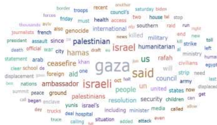
Figure 1 Word Cloud

A word cloud also known as a tag cloud is a visual representation of text data, where the size of each word indicates its frequency or importance within a given dataset.